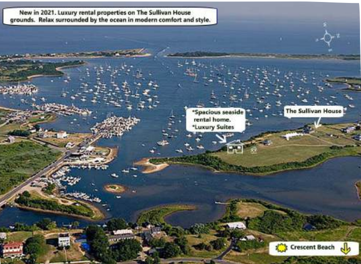
Surrounded by ocean views

Relax surrounded by the sea, in a private location right on The Sullivan House grounds. The King Seaview Suite and the Queen Seaview Suite feature private seaside terraces, AC, oversized bathrooms and elegantly appointed rooms. Guests enjoy stunning views, modern comforts and relaxation. Call 401.466.5020 or book online.