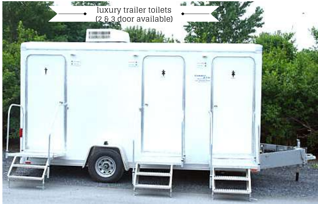
luxury trailer toilets (2 & 3 door available)