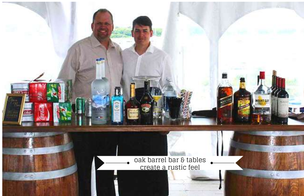
oak barrel bar & tables create a rustic feel