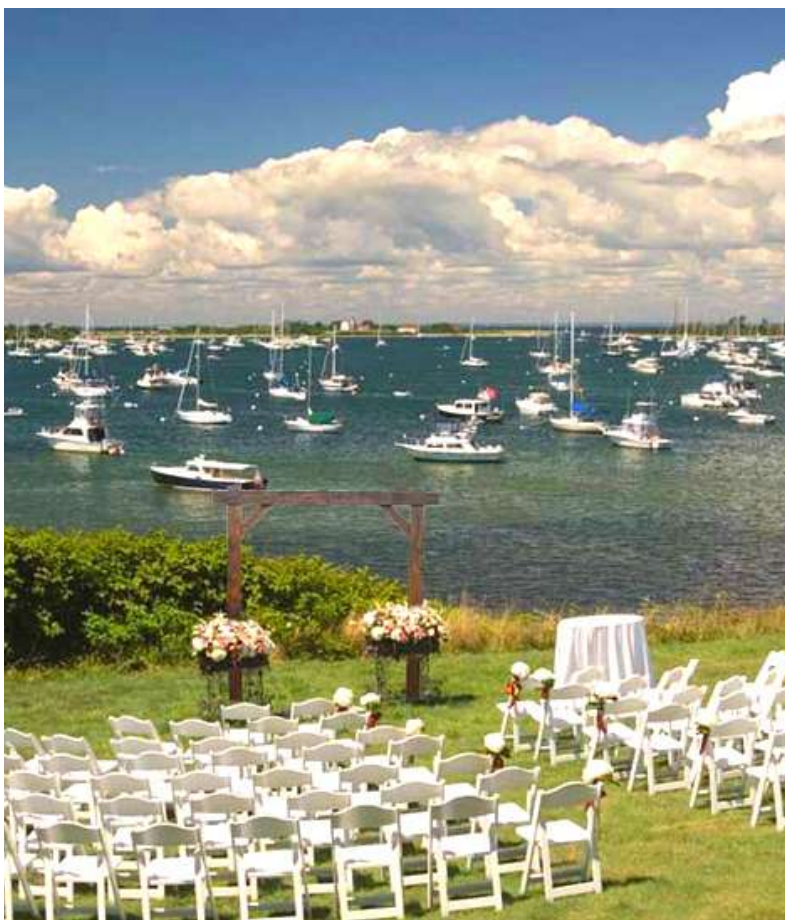
white garden folding chairs & arbor