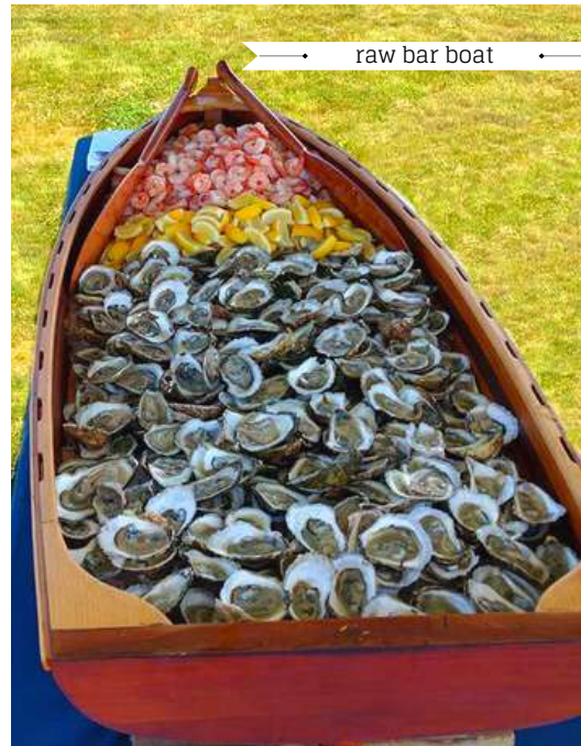
raw bar boat