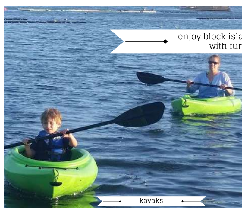
enjoy block island's seaside vibe with fun activities