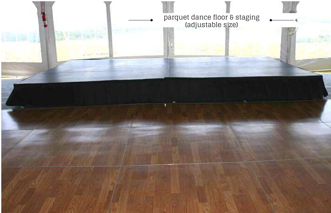
parquet dance floor & staging (adjustable size)