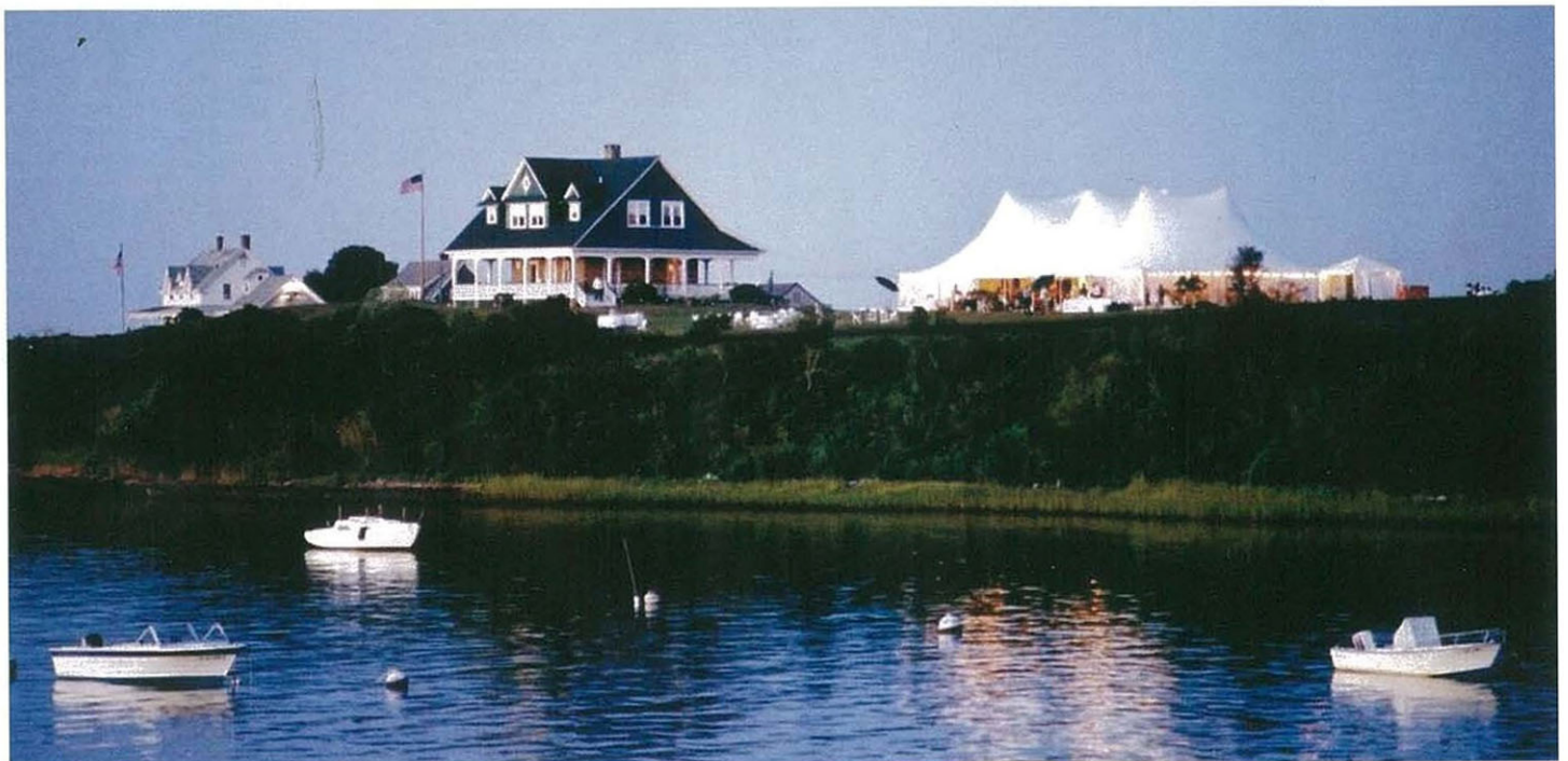
The Sullivan House on Block Island