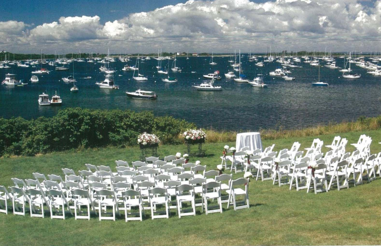
Ceremony site at The Sullivan House