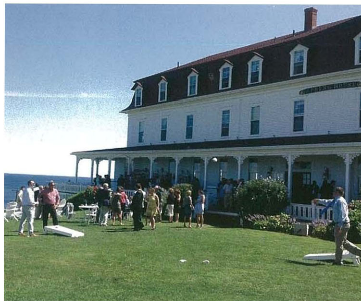
The Spring House on Block Island

The natural beauty of Rhode Island's Block Island promises couples an event with natural elegance. The iconic Spring House hosts weddings big and small with Victoria's Parlor, a Victorian-era lounge area with a bar and dance floor, lending a sophisticated ambiance on the inside with a wraparound veranda and lush lawn peppered with Adirondack chairs overlooking the sea outside. The historic Sullivan House, built in 1904, is the backdrop for tented weddings on the property, all with panoramic water views. "Block Island is ideal for destination weddings. It is easily accessible but once you get here, it is like being in another world," says Rosalie O'Brien Kivlehan, owner of The Sullivan