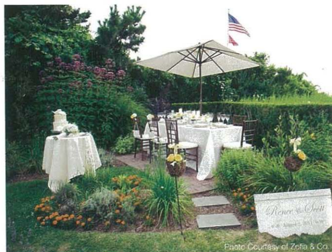
The Wauwinet on Nantucket Island

It can be easy to forget that some of the most desired wedding destinations in the world are right in our backyard. The exquisite islands of Nantucket, Martha’s Vineyard and Block Island are as distinctive as they are serene. When hosting a wedding in one of these extraordinary places, the nuptial adventure begins as soon you and your guests board the ferry or hop on the plane, making for an unforgettable experience and treasured memories. For some couples, marrying on these renowned islands evoke the best of childhood memories while for others, saying “I do” miles away from the mainland starts a new chapter all its own. Whichever the case, a wedding on Nantucket, Martha’s Vineyard or Block Island will be one to remember.