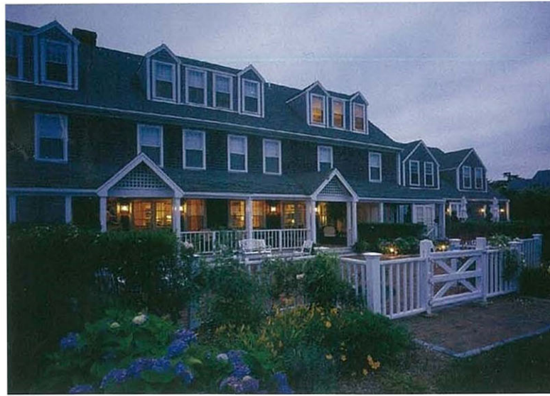
The Wauwinet on Nantucket Island

With its charming mystique and rich history, Nantucket is an idyllic setting for both grand nuptial celebrations and romantic, intimate weddings alike. Thirty miles out to sea, the island offers a handful of full service hotels for a wedding weekend as well as cozy inns and sweeping beaches for a decidedly casual affair. The Wauwinet overlooks glistening Nantucket Bay and though little more than eight miles from downtown, it feels a world away. It's the pristine luxury locale for your whole wedding entourage to take over the 32 guest rooms and cottages for a private weekend retreat. Guests can get to know one another before the big day over champagne and s'mores on the beach at nightfall. In May 2015, The Wauwinet will open their newly converted three bedroom cottage, Anchorage House at The Wauwinet. "It has that feeling of a home away from home – the entire wedding party can enjoy a rehearsal clambake on the beach followed by a tented wedding ceremony and reception on the lawn and a goodbye brunch on the following day," says Aoife Owens, Director of Sales and Marketing at Nantucket Island Resorts. "Nantucket is such a beautiful, special place that most couples fall in love with the island and want to share it with their friends and families. Its pristine beaches, dramatic bluffs, the traditional elements of the downtown historic district all pro-